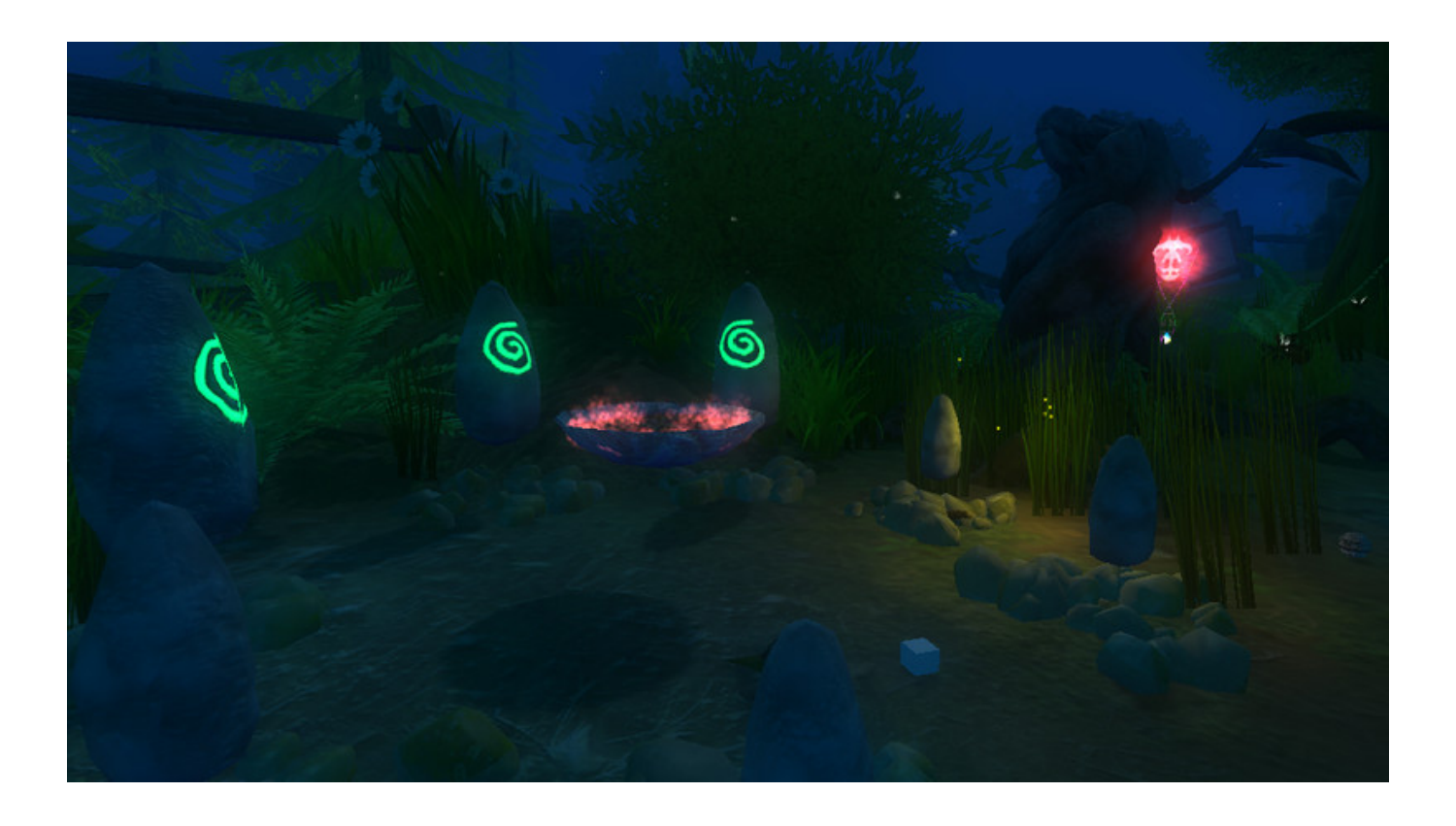
Download ->->-> http://bit.ly/2NPjoSm